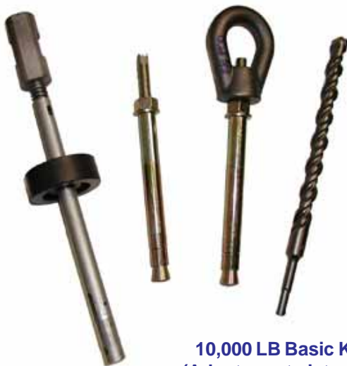
10,000 LB Basic Kit (Adapter not pictured)